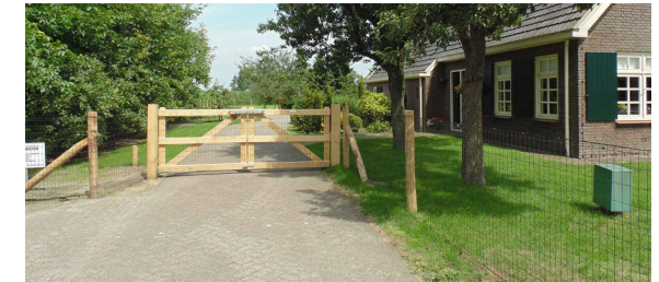
* (only for visual representation. Subject to change as per manufacturer recommendation)